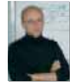
Heinrich Barta PrintSoft Systems GmbH Munich